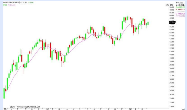
BANKNIFTY WEEKLY CHART