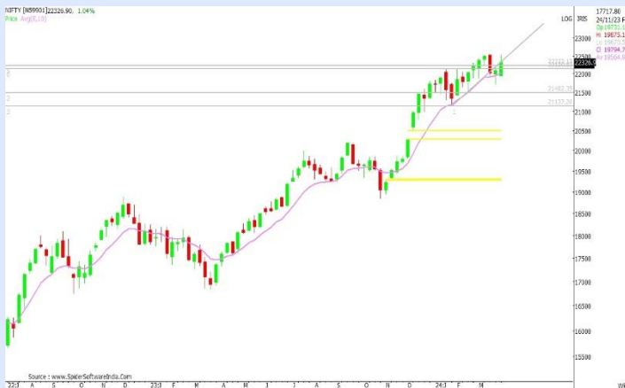
NIFTY WEEKLY CHART

As we saw the Price Movement in Nifty Spot in last week that In Upside is 22427.45 and in Downside 21777.65.